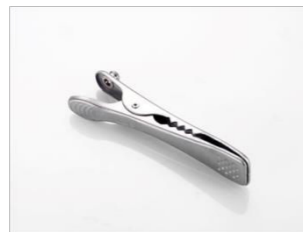
ECG: Non-traumatic alligator clips