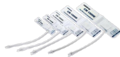
NIBP: Variety of cuffs fit multiple patient sizes